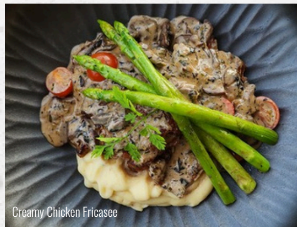
Creamy Chicken Fricasee