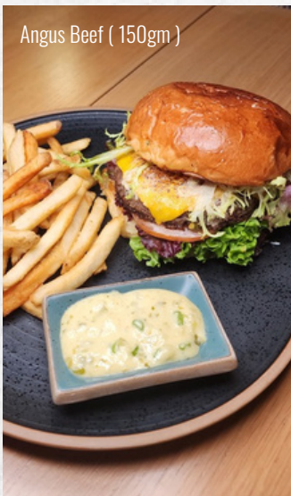
Angus Beef ( 150gm )