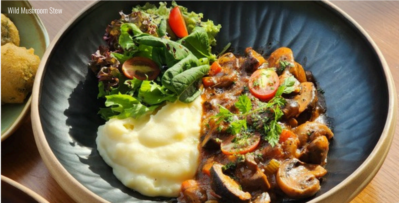
Wild Mushroom Stew

AVAILABLE FROM 5PM - 11.00PM (LAST CALL 10.45PM)