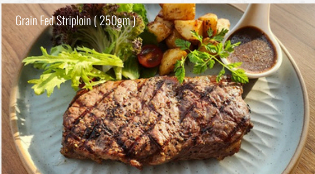
Grain Fed Striploin ( 250gm )