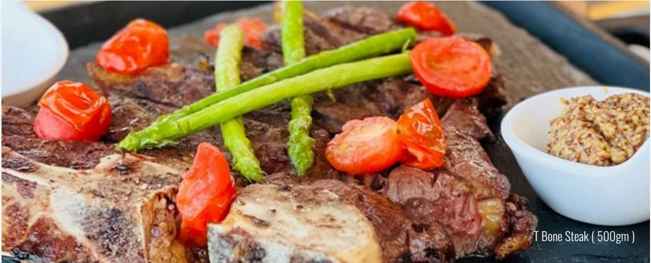
T Bone Steak ( 500gm )

AVAILABLE FROM 5PM - 11.00PM (LAST CALL 10.45PM)