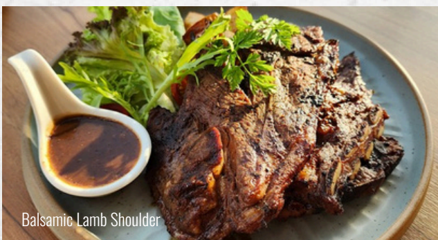
Balsamic Lamb Shoulder