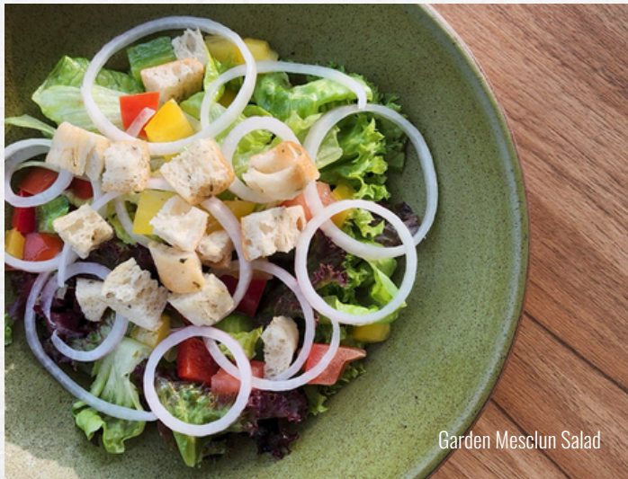
Garden Mesclun Salad