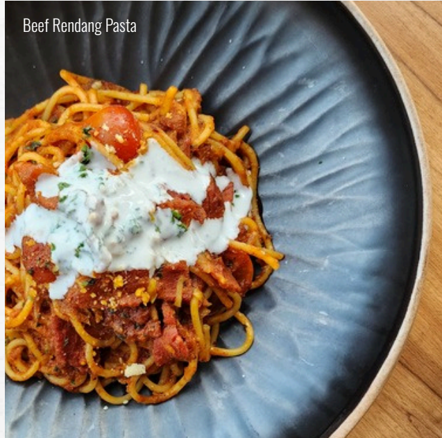
Beef Rendang Pasta