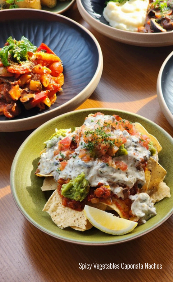
Spicy Vegetables Caponata Nachos

AVAILABLE FROM 5PM - 11.00PM (LAST CALL 10.45PM)