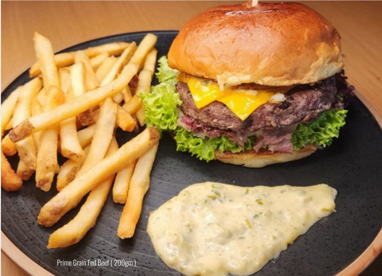
Prime Grain Fed Beef ( 200gm )

AVAILABLE FROM 5PM - 11.00PM (LAST CALL 10.45PM)