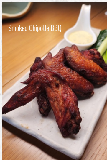
Smoked Chipotle BBQ