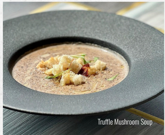
Truffle Mushroom Soup

Poached Shrimp | Tomato Broth | Fresh Basil