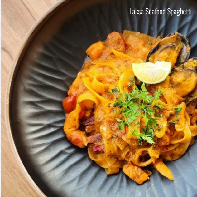
Laksa Seafood Spaghetti

AVAILABLE FROM 5PM - 11.00PM (LAST CALL 10.45PM)