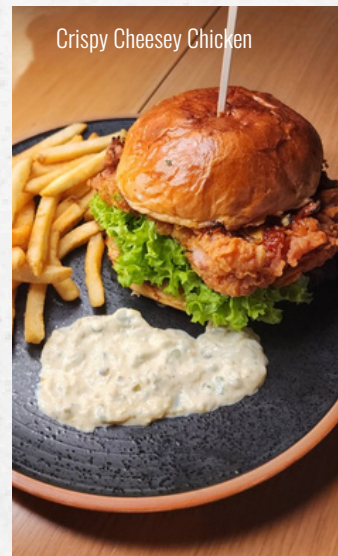
Crispy Cheesy Chicken

Deep Fried Chicken | Burger Bun | Fries Lettuce | Tomato | Cheddar Cheese