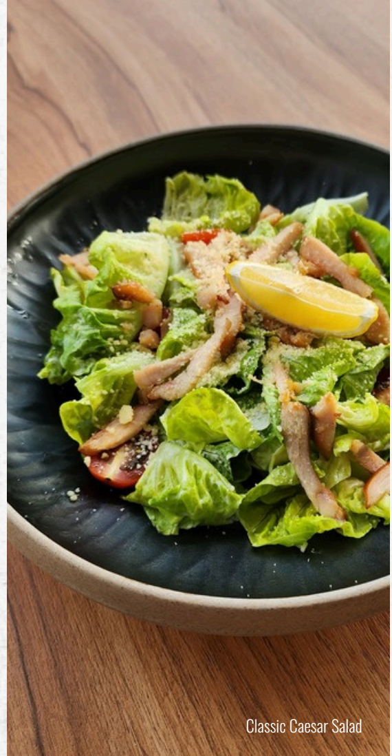
Classic Caesar Salad

Smoke Chicken | Garlic Croutons | Romaine Lettuce Cherry Tomato | Caesar Dressing