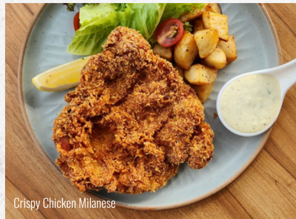
Crispy Chicken Milanese

Fried Seabass | Fries | Mushy Peas Tartare Sauce | Lemon